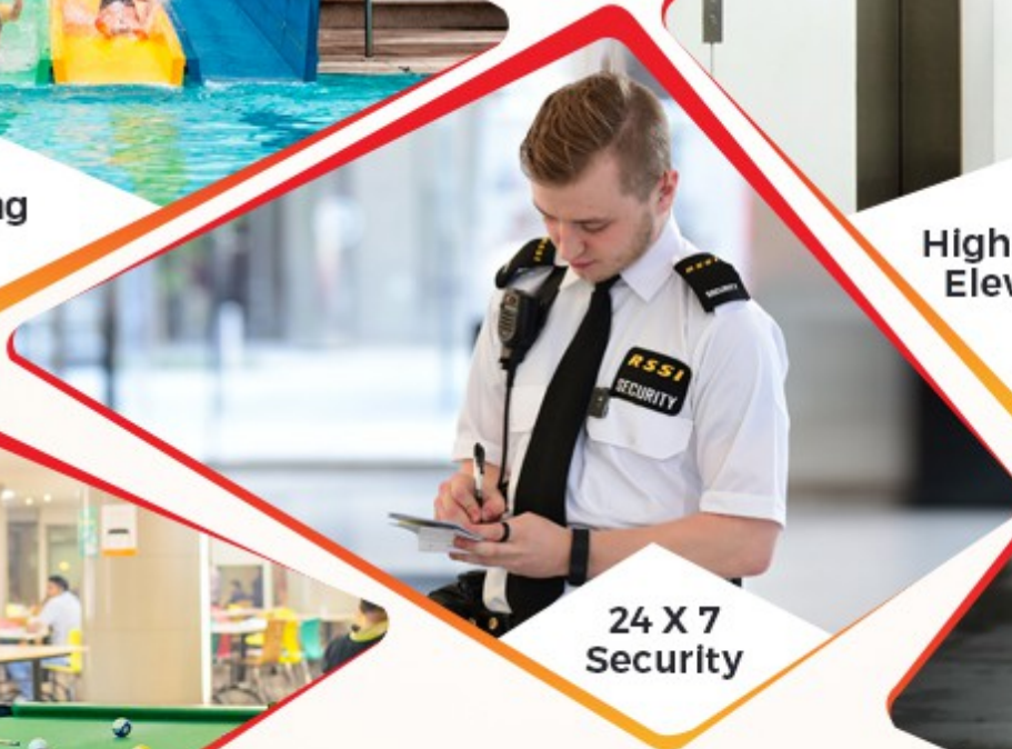
24 X 7 Security