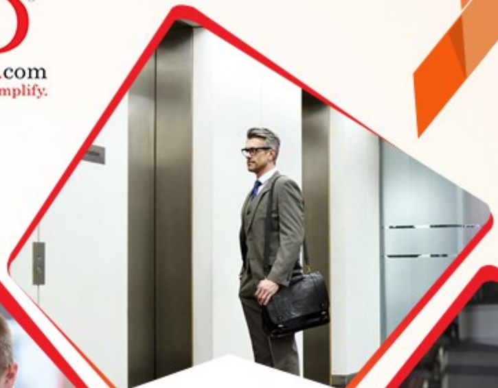
High Speed Elevators