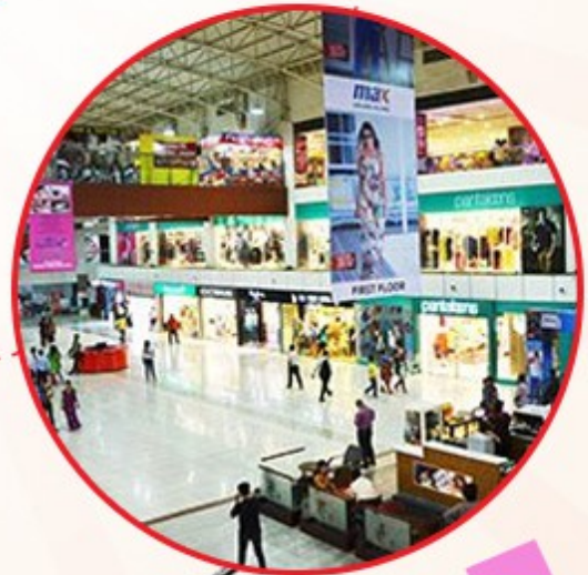
WORLD SQUARE MALL